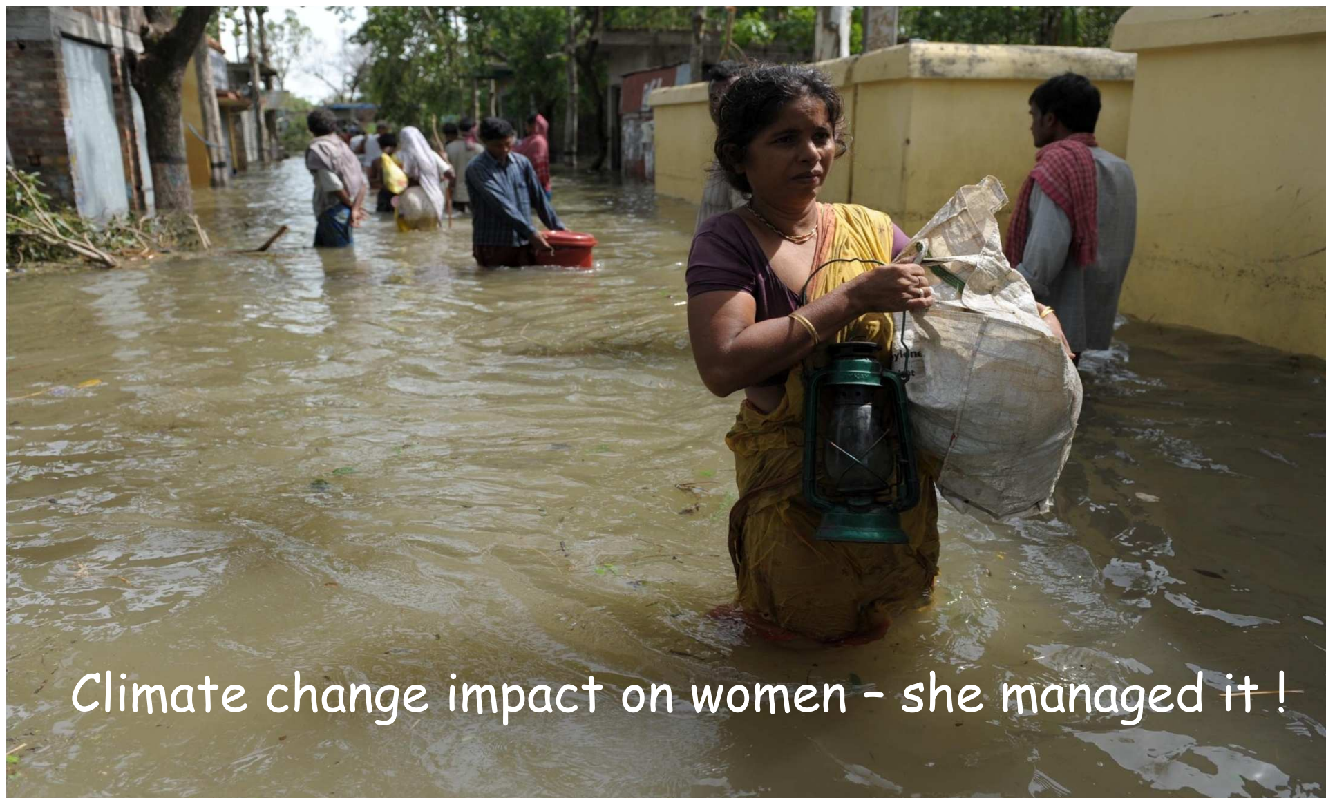
Climate change impact on women - she managed it!