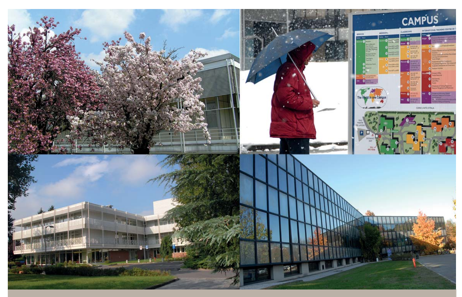
The ILO Turin Centre's facilities

Located in an attractive park on the banks of the River Po, the Centre's campus provides a congenial environment in which to live and study.