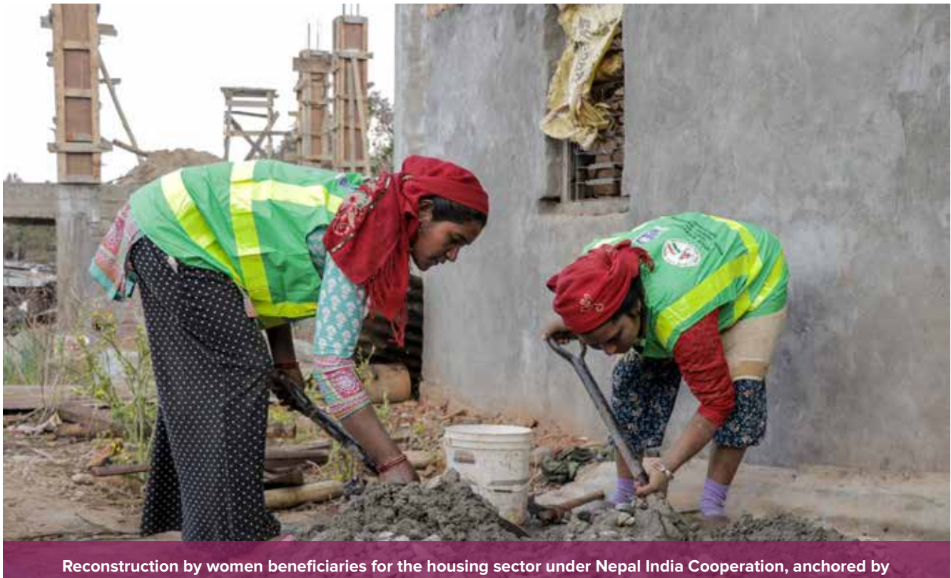
Reconstruction by women beneficiaries for the housing sector under Nepal India Cooperation, anchored by UNDP in 2019, adopting build back better practices (earthquake-resistant).