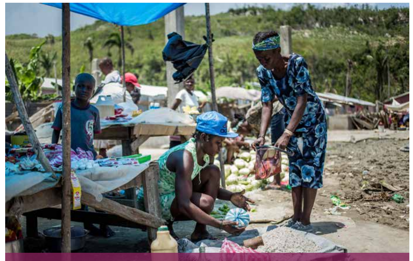
Women selling and buying essential items at a post-disaster makeshift shop (Haiti earthquake, 2010).