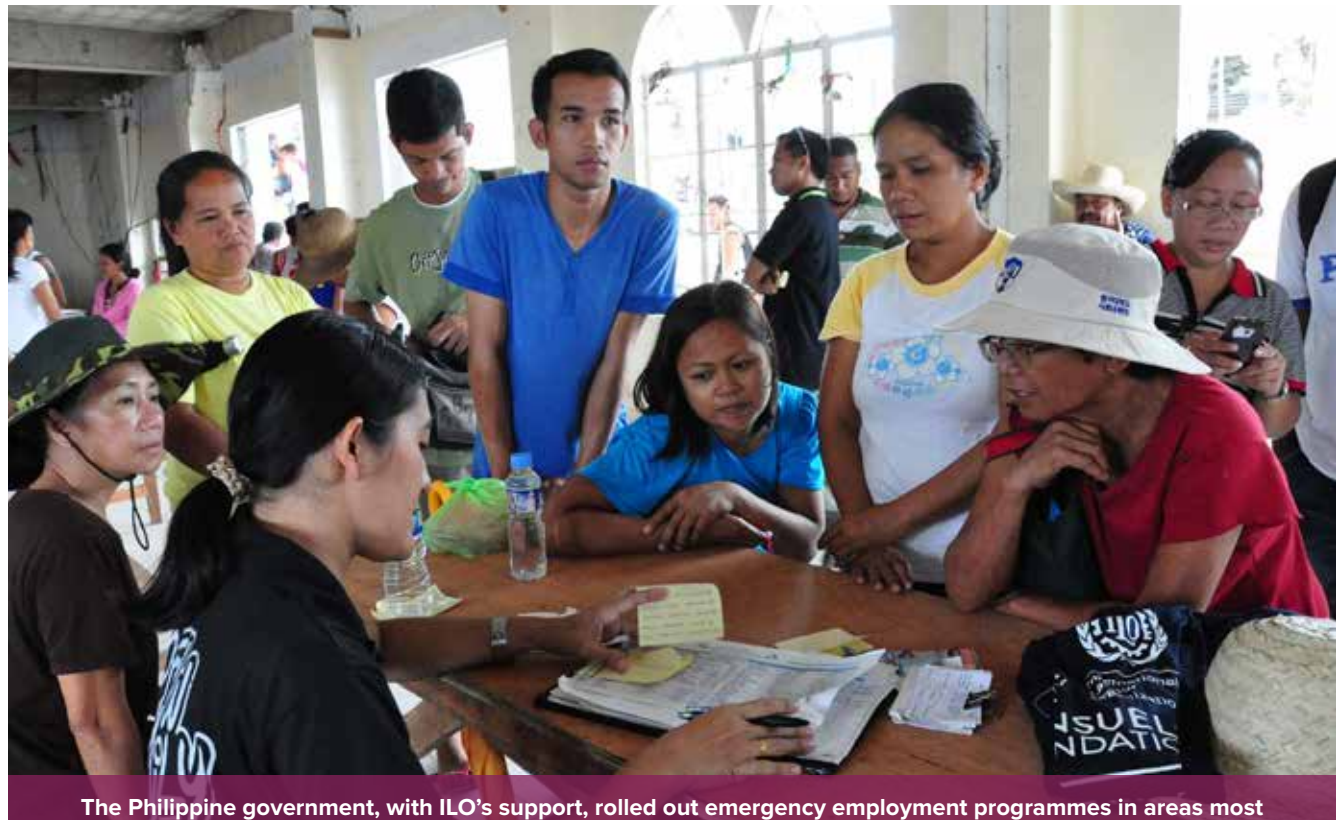
affected by Typhoon Haiyan, including Tacloban.

umbrella, almost 80,000 informal sector workers subscribed to the national insurance schemes while benefitting from immediate relief from the aftermath of Haiyan.