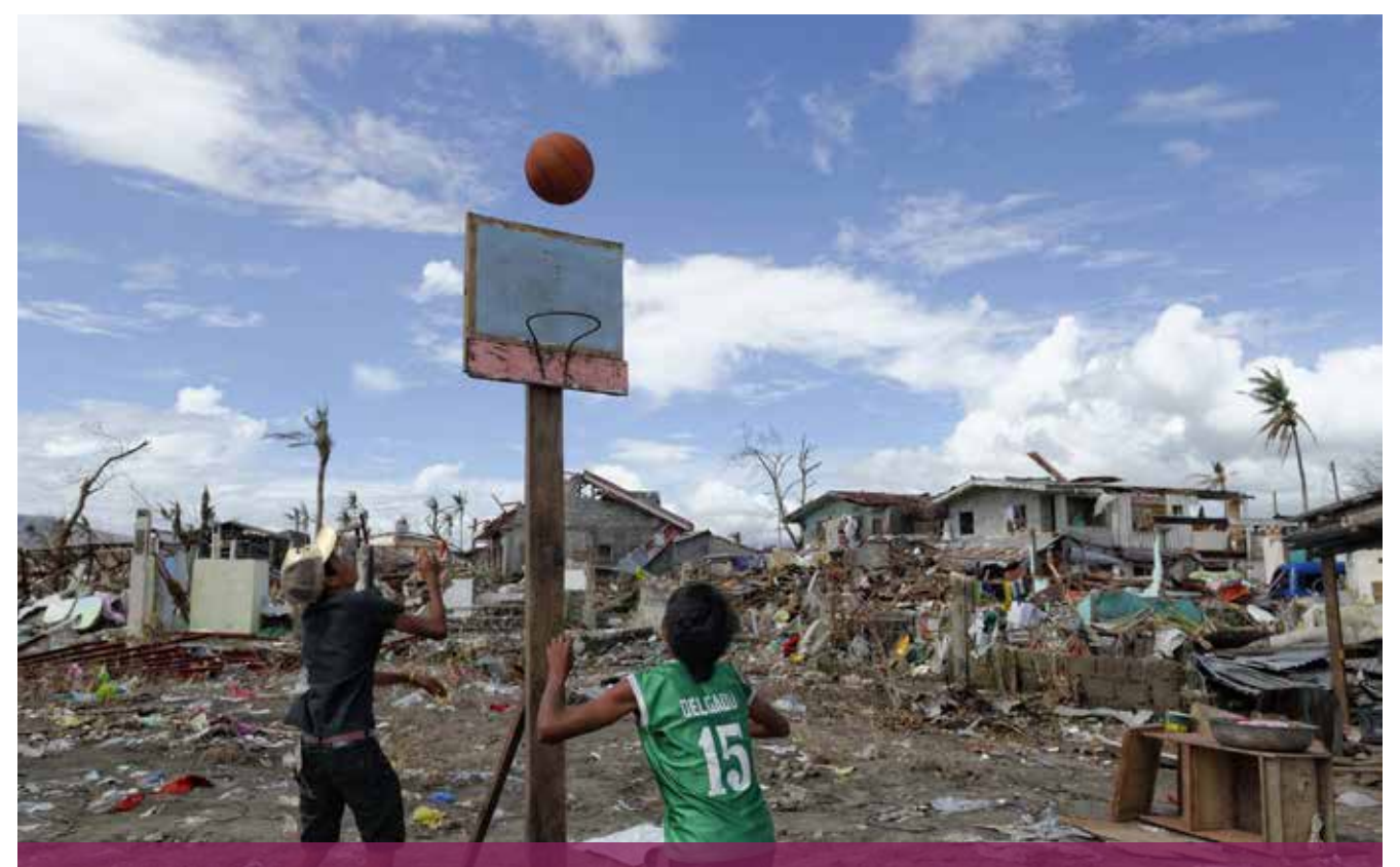
Above all, hope and fortitude in full display at Tacloban city (after typhoon Haiyan hit Philippines in 2013).