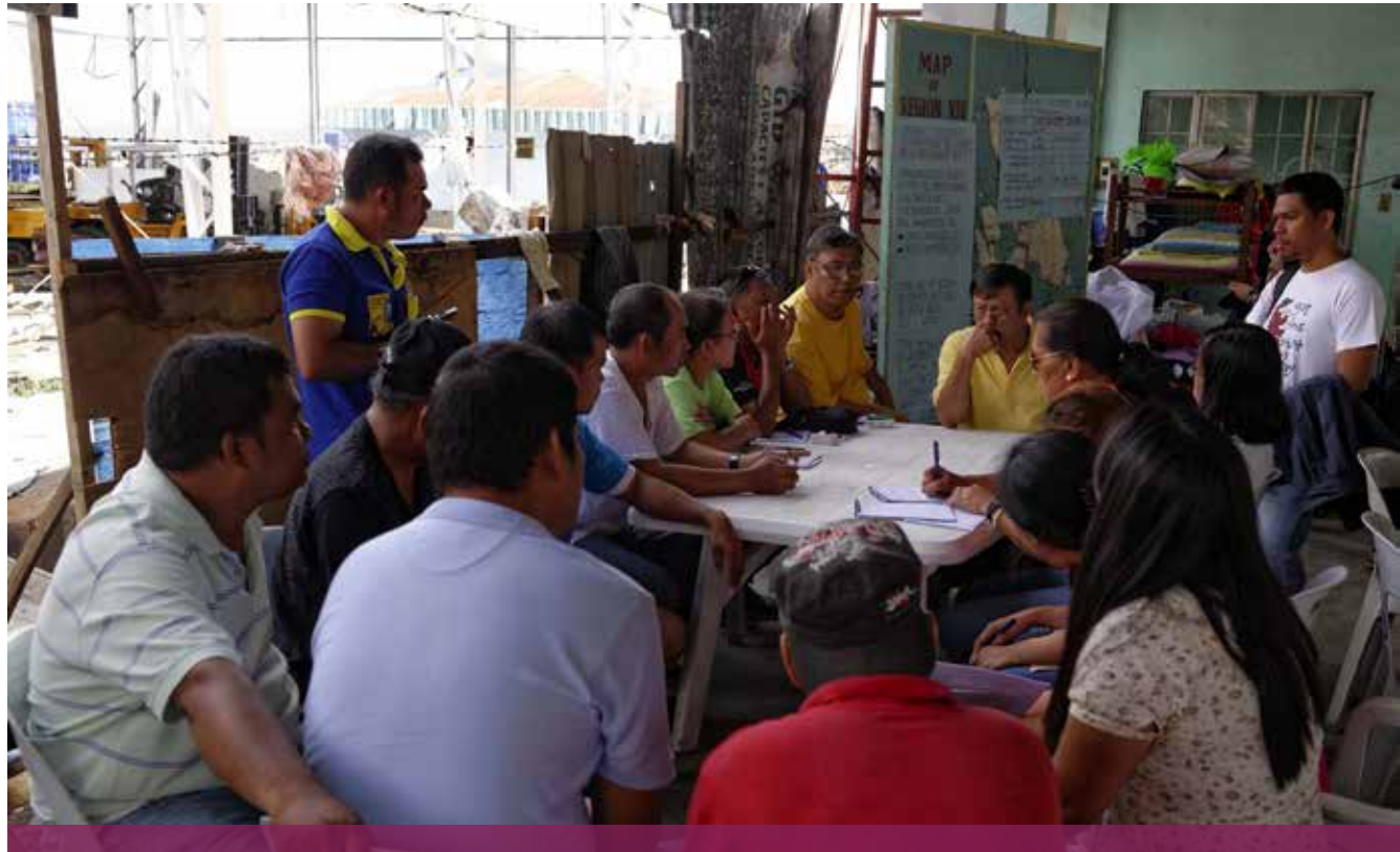
ILO officials discuss emergency employment needs with officials of the DOLE in Tacloban after super typhoon Haiyan hit Philippines in 2013.

of enforcement of the labour law may allow those who profit from disaster to act with impunity, especially in such matters as forced labour, child labour, trafficking of children or workers, and exposure to hazardous working conditions. This may have long-term effects on the observation of International Labour Standards in the country.<sup>54</sup>