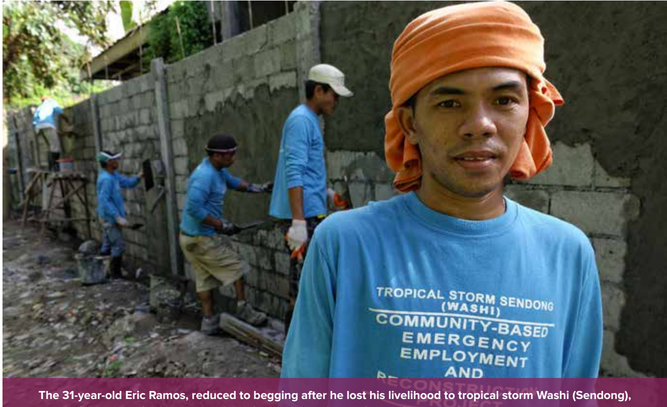
acquired new skills in construction with the help of the ILO AusAid emergency employment programme.

projects and building capacity for local resource-based (LRB) works in crisis-affected areas.<sup>81</sup> Tools and guidelines were developed for infrastructure works that were proven to be highly relevant to crisis response works in the Philippines.<sup>82</sup> The EIIP also contributed to a regional initiative to develop a training course for local agencies (both public and private sector) to mainstream employment creation in DRR and disaster response. A first edition of this course was run in disaster-affected areas in Mindanao in late 2013.<sup>83</sup>