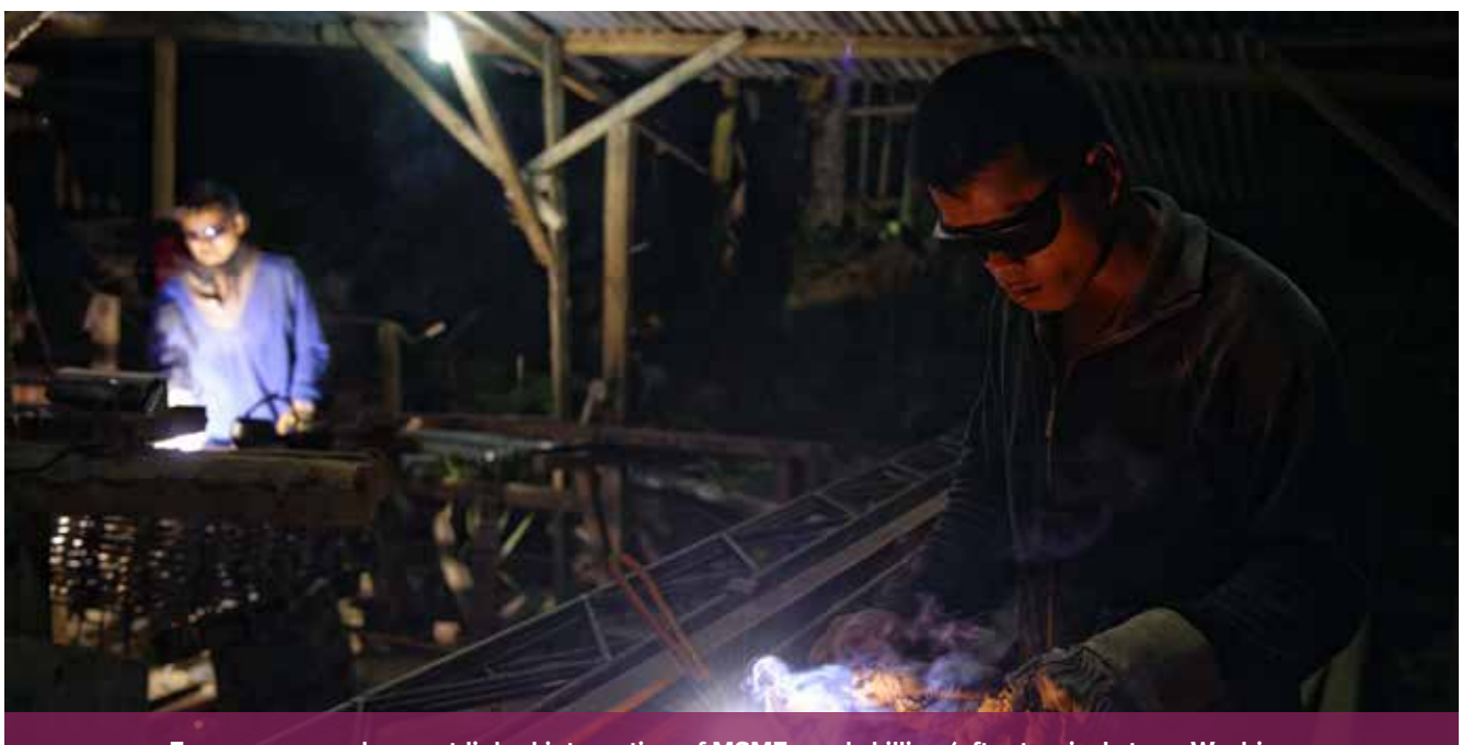
Emergency employment-linked integration of MSMEs and skilling (after tropical storm Washi or Sendong hit Philippines in 2011).

Thus, it becomes imperative for governments to immediately begin providing small capital grants or opening a window for MSMEs to avail collateral-free credit on easier terms for refurbishment or replacement of machinery, either of the same technology or of more advanced technology (for example, green) and associated equipment. Many countries set up public-funded industrial areas, parks and special economic zones to host and support MSMEs of different types including cooperative enterprises. In such cases, increasing the resilience of industrial estate infrastructure also becomes important to help MSMEs recover faster and strengthen their own resilience.