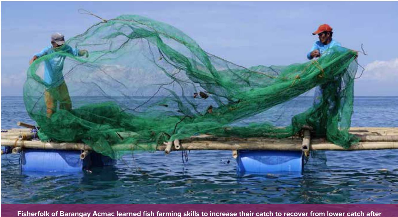
Fisherfolk of Barangay Acmac learned fish farming skills to increase their catch to recover from lower catch after the tropical storm Washi or Sendong hit Philippines in 2011, with the help of the ILO AusAID emergency employment programme.

Thus, increasing the coverage and quality of social protection in general, and including populations affected by disasters, is essential to ensuring inclusive recovery, strengthening resilience to future shocks, and supporting growth and productivity in normal times. Comprehensive social protection systems, including social protection floors, can be designed as part of national disaster preparedness strategies.<sup>62</sup> In some countries, nationally-defined social protection floors can be adapted and used in times of crisis to scale-up access to essential healthcare and basic