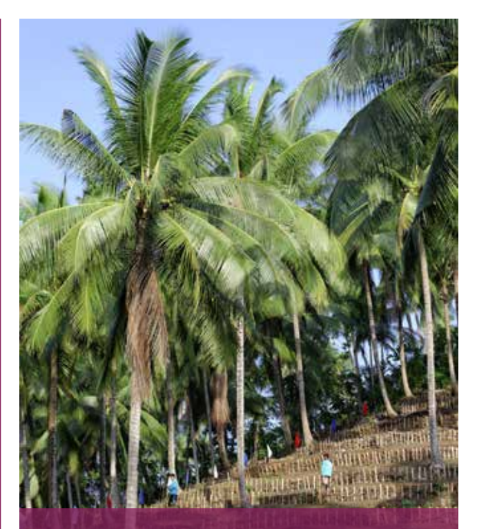
Sloping agricultural land technology (SALT), aimed at increasing productivity and preventing floods or damage to crops, was deployed to rebuild farming communities in keeping with an ecosystem perspective (after tropical storm Washi hit Philippines in 2011)