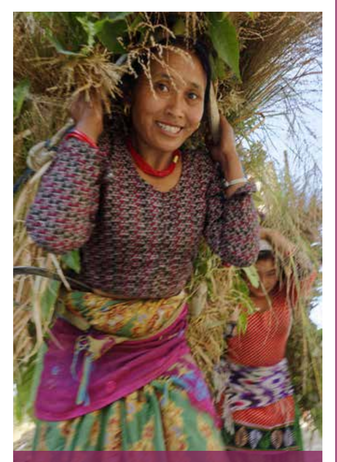
Women farm workers in a post-disaster area (Nepal earthquake, 2016).

the PDNA Guidelines (Volume B)<sup>3</sup> for the estimated effects and impacts of a disaster on the cross-cutting ELSP sector, factoring in the assessed damage and loss to infrastructure, productive and social sectors. This short, action-oriented Guide aims to assist senior advisers and officials from the national, provincial and local governments, intergovernmental organizations