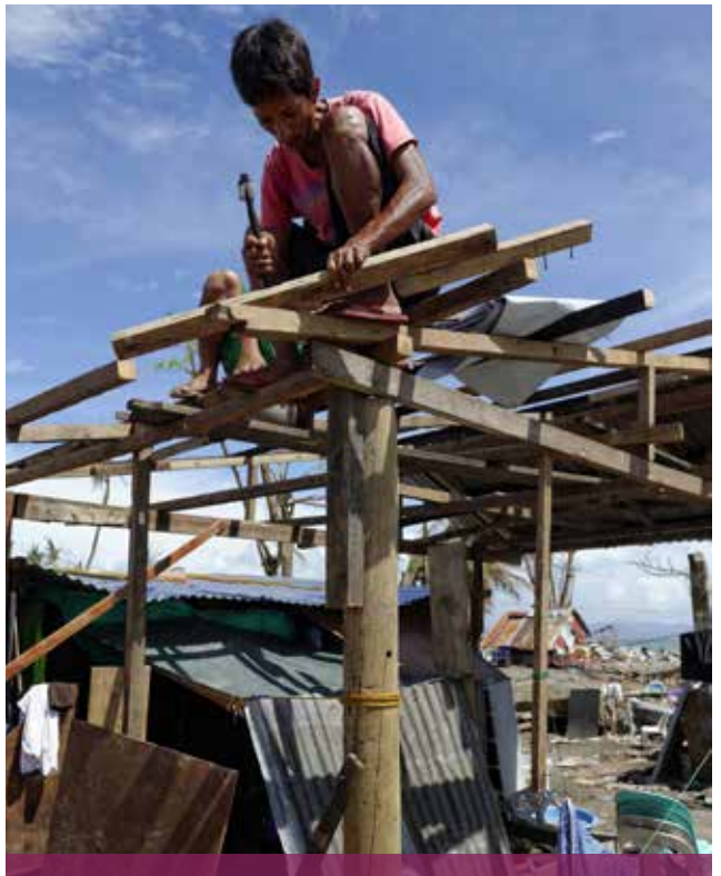
Millions of people on the unfavourable side of the digital divide struggled to rebuild their lives and livelihoods after typhoon Haiyan hit Philippines in 2013.