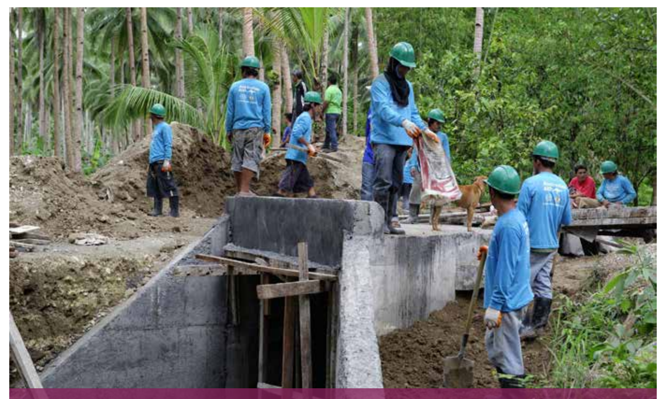
People being provided on-job training while constructing a box culvert as part of the ILO AusAID emergency employment programme (Washi or Sendong tropical storm, 2011).