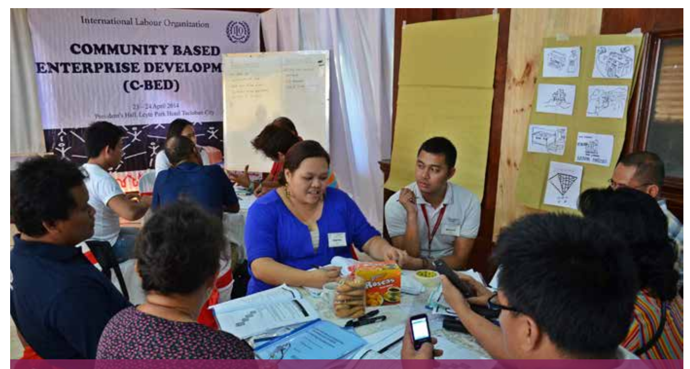
Small-scale business owners, vendors and aspiring entrepreneurs learn the basic principles of business development through the Community-Based Enterprise Development after typhoon Haiyan or Yolanda hit Philippines in 2011.

The active participation of key economic and labour market stakeholders in the recovery-planning process is essential for developing a well-targeted and inclusive ELSP recovery framework. Besides involving national and local government functionaries and public and non-governmental institutions, efforts should be made to facilitate the participation of representatives of the affected population as well as other civil society organizations that may be active at the local level. These stakeholders should be consulted in planning the recovery, identifying and prioritizing interventions, area-specific programme preparation, and thereafter kept in the loop throughout the implementation stages in disaster-affected zones. Adopting such broad-based, consultative approaches enhances information exchange, permits negotiation and advocacy, leading to inclusive decision-making.