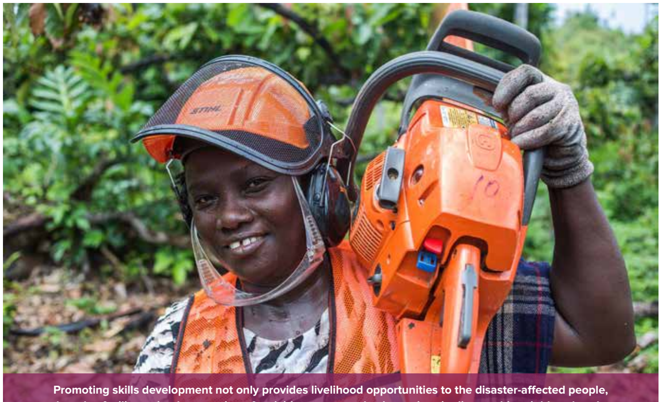
but also facilitates implementation of activities to restore basic services in disaster-arrected people, (Rehabilitation and reconstruction programs in Haiti after the 2010 earhquake)