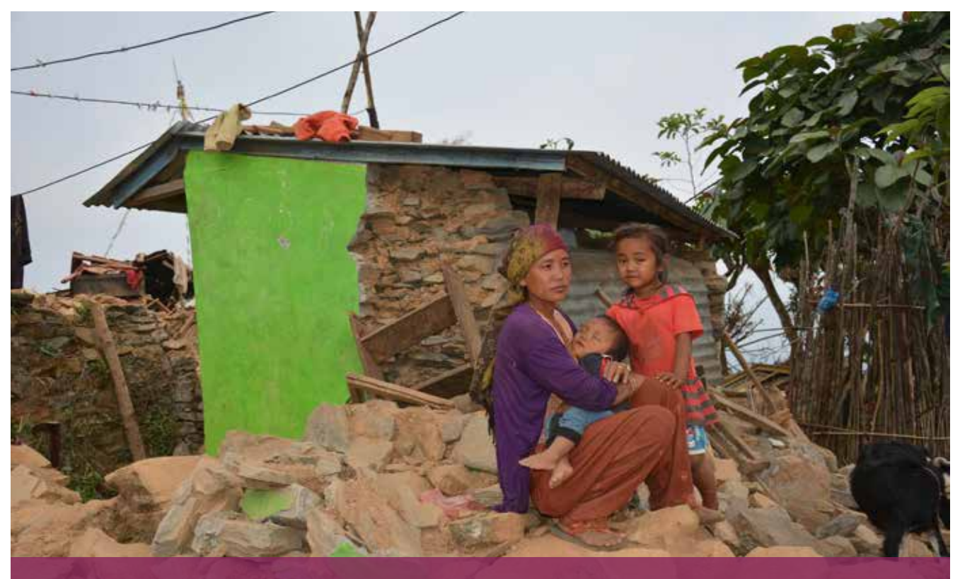
Women and children along with persons with disabilities are some of the most vulnerable during disasters (Nepal earthquake, 2016).

higher risk of catastrophes, the poor are evidently more vulnerable than the non-poor with higher losses to incomes, assets and lives. Sustained low incomes, lack of savings, weaker social networks, low asset bases and heavy reliance on climate-sensitive livelihoods renders all these groups with limited capacity to cope with natural disasters.