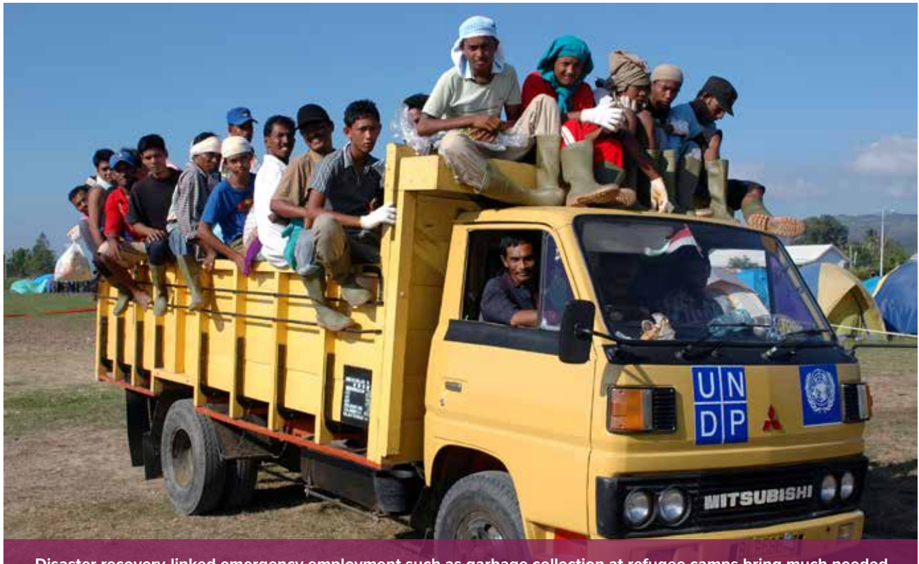
Disaster recovery-linked emergency employment such as garbage collection at refugee camps bring much needed succour to affected populations that have lost livelihoods (Banda Aceh, Indonesia tsunami, 2004).

approach enables recovery and building resilience through job creation and promotion of decent work.<sup>14</sup> The ILO recognizes decent work as the foundation of sustainable poverty reduction that paves the