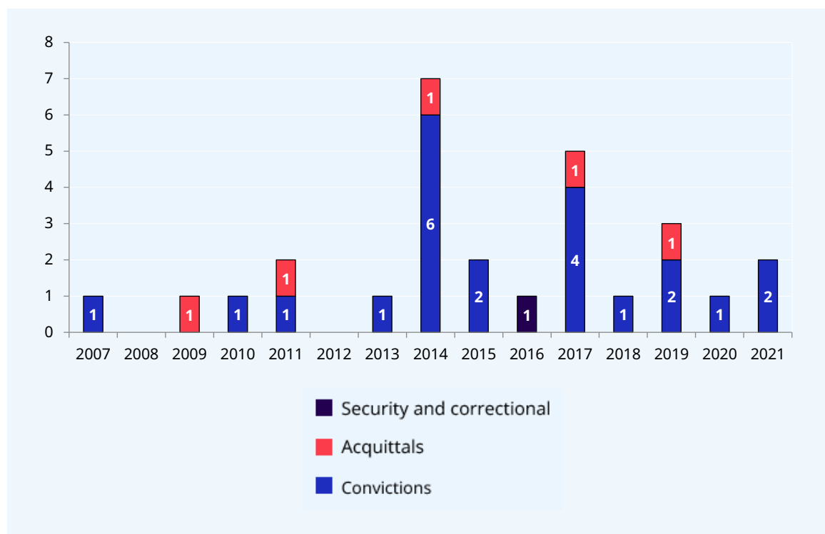
Figure 1. Sentences: Security and correctional measures, acquittals and convictions – Office of the Special Prosecutor for Crimes against Judicial Officials and Trade Unionists of the Office of the Public Prosecutor (2007–21)

Source: Prepared by the International Labour Affairs Unit of the Ministry of Labour and Social Welfare based on information from the Office of the Special Prosecutor for Crimes against Judicial Officials and Trade Unionists of the Office of the Public Prosecutor: 2007 to September 2021.